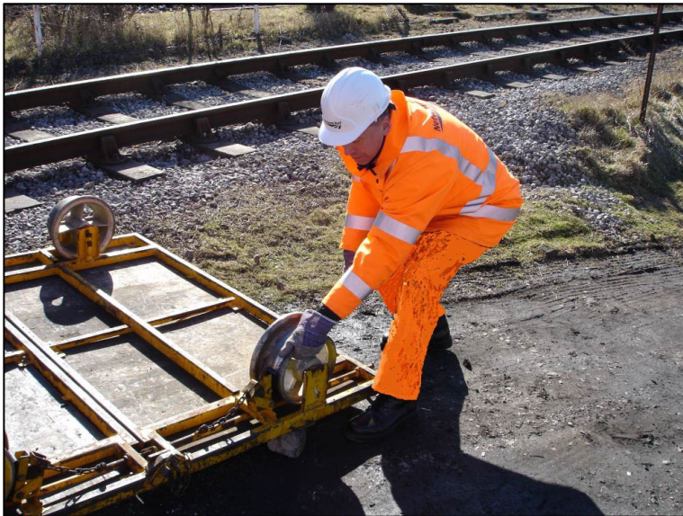
Figure 1 Checking Braked Wheels